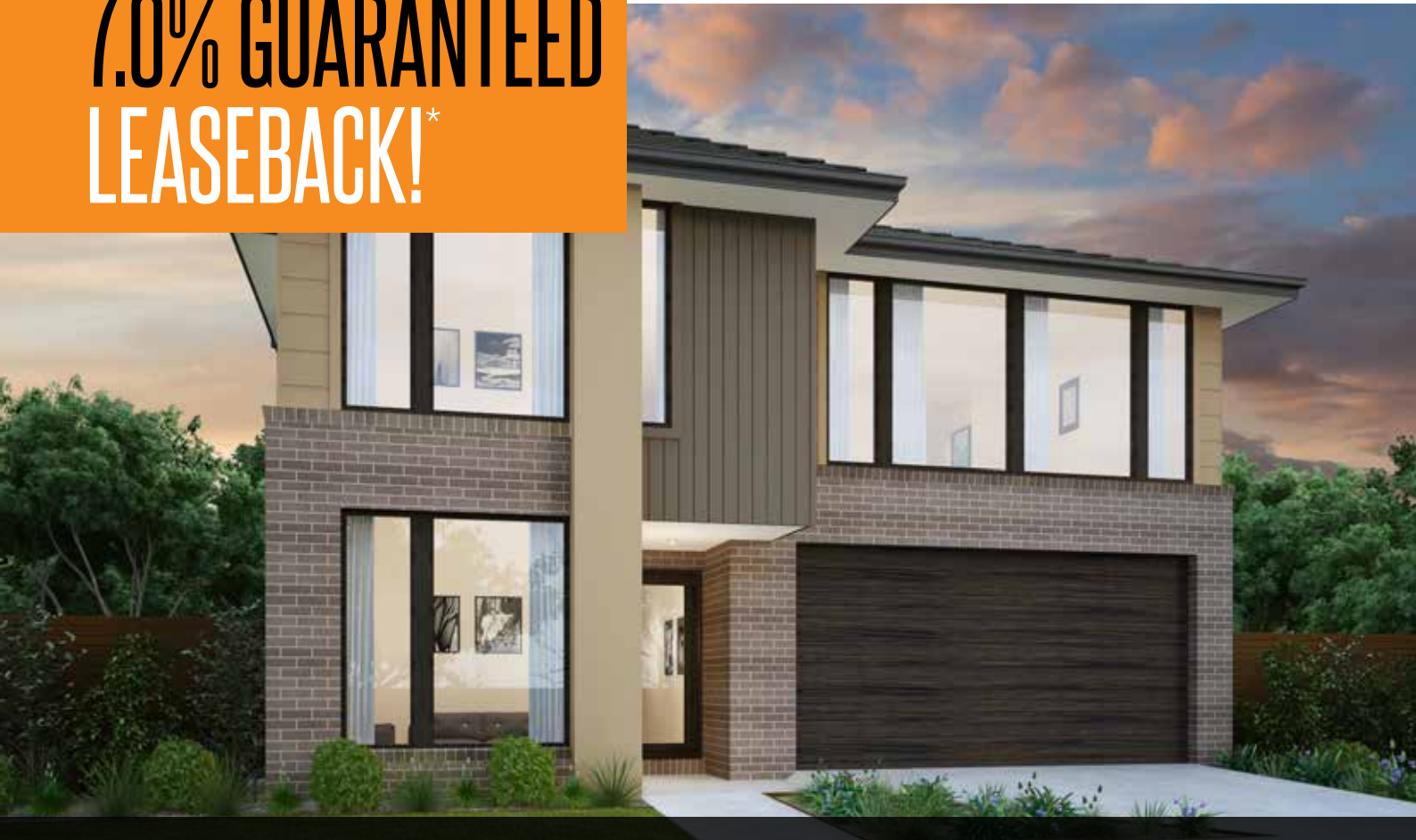
image for illustrative purposes only