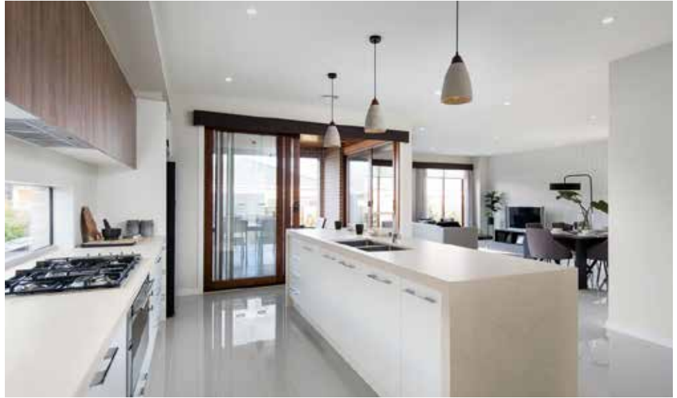
Photo is for illustrative purposes only and does not depict the home for sale. This image contains internal or external luxury upgrade items and furniture not included in the home price.